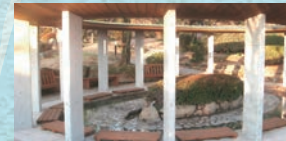
Oniishi Bozu Jigoku